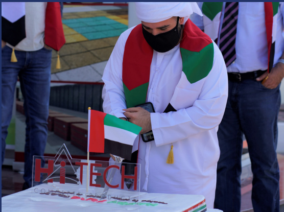
HiTech Concrete Products