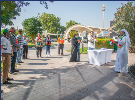
Ream Emirates Aluminum